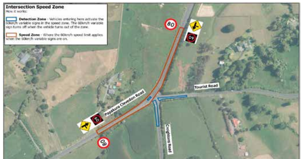
Intersection of Papakura Clevedon Road, Tourist Road and Creightons Road, showing proposed speed restrictions.

Auckland Transport will consider all community feedback and present a recommendation to Franklin Local Board. The Local Board will provide feedback